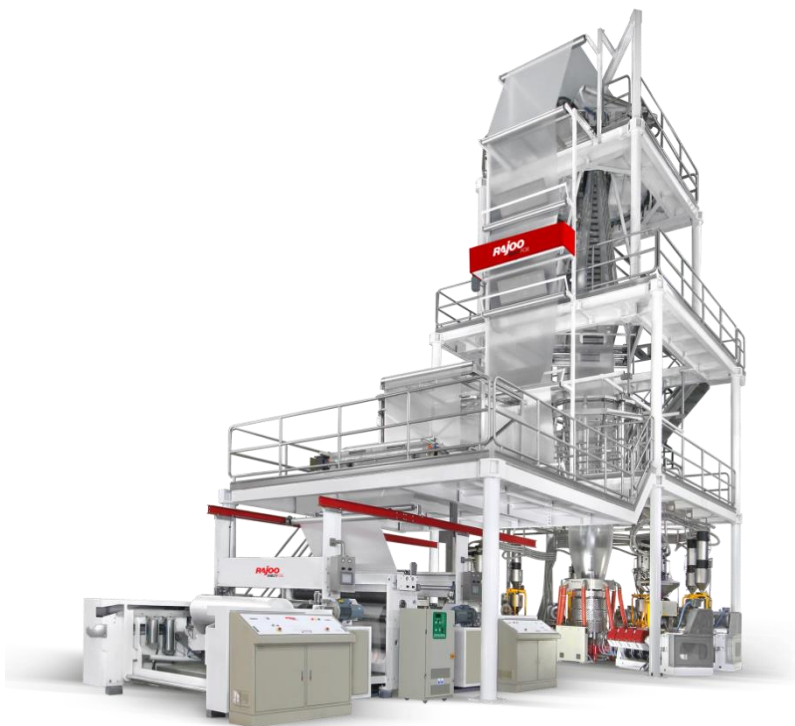
Heptafoil – Seven Layer Co-Extruded Blown Film Line

In order to further its already strong application know-how, the RIC is intended to help RAJOO “Know Its Customer’s Customers (KYCC)”, and accordingly develop plastic extrusion solutions to match their needs down to a ‘T’.